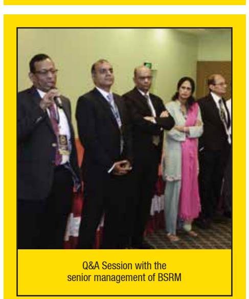
Engrossed participants at the event