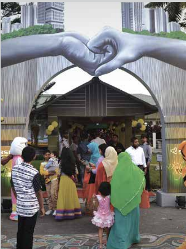
The front view of Bogra Dealers' Night Event