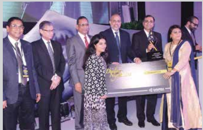
Handing over Champion's Award to Hashem & Sons (Barisal)