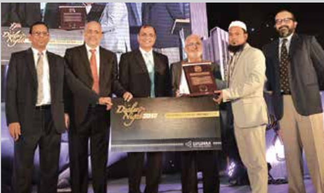
The Chairman handing over Chairman's Award Bronze 2016 to Anowar Trading (Chittagong)