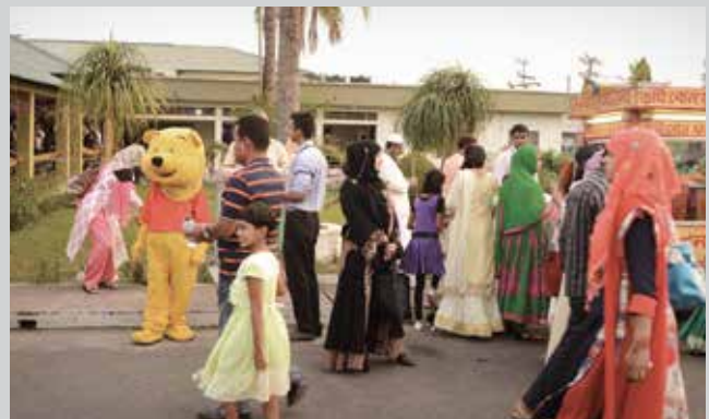
Dealers Families enjoying at Bogra Dealers' Night Event