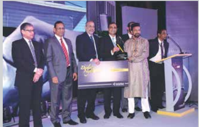
Handing over Champion's Award to Ershad Brothers Corporation (Dhaka-1)