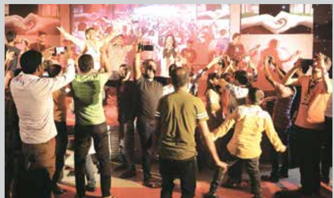
Guests having a gala time at Bogra Dealers' Night musical soiree