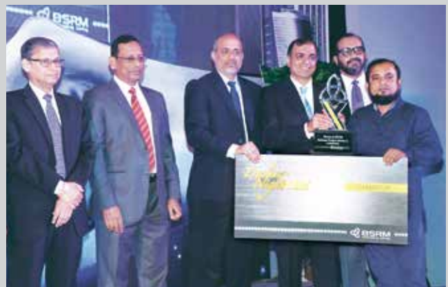
Handing over Champion's Award to Rahman Traders (Dhaka-3)