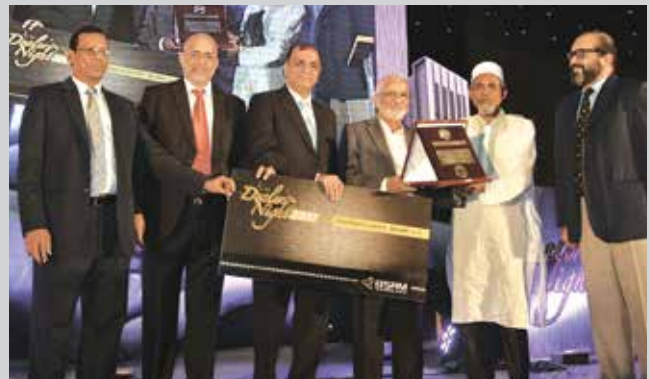
The Chairman handing over Chairman's Award Silver 2016 to Bashundhara Trading (Noakhali)