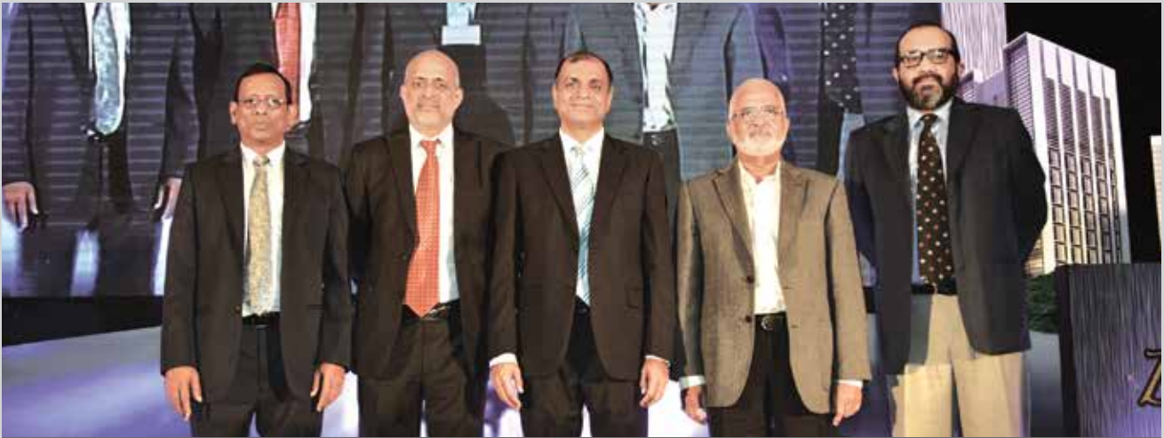
Chief Officials of BSRM at Chittagong Dealers' Night