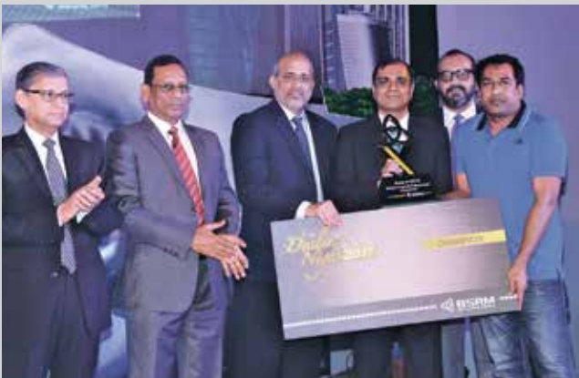
Handing over Champion's Award to Brothers Corporation (Mymensingh)