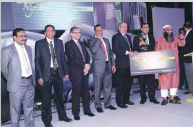
Handing over Champion's Award to Kazi Steel Agency (Dhaka-2)