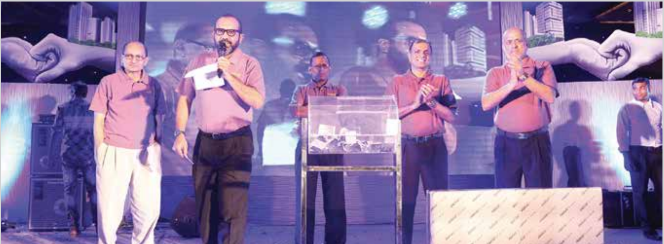
Raffle Draw Ceremony at Bogra Dealers' Night