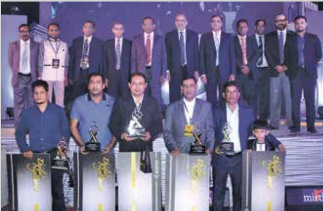
Top management and Lead Sales with Loyal Dealers of BSRM