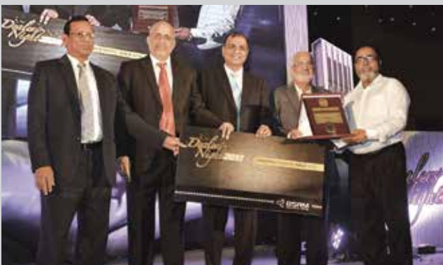
The Chairman handing over Chairman's Award Gold to Fatema Traders (Comilla)