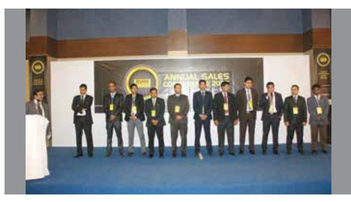
Khulna Regional Sales Team

In regional presentations, sales teams from different regions, present their target achievements for the year, share their ideas, and update the audience about their current projects. A healthy competition among different sales regions develops which enhances the overall productivity of the company's sales division. This year's highest performer was Khulna Sales Team.