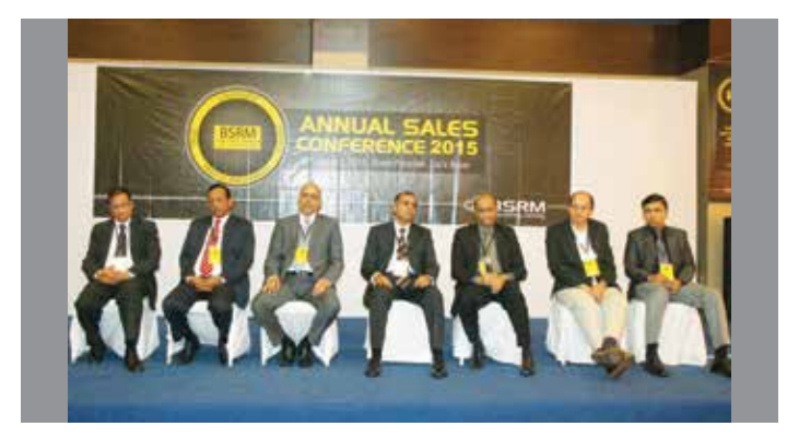
Top Management Panel